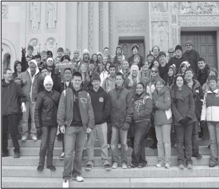
Above: Forty three Trinity Catholic students and eight chaperones traveled to Washington, D. C. from January 20 through January 25 for the 39 th annual March for Life. The group is pictured in front of the National Basilica after attending Mass with Bishop Jackels and 600 other pilgrims from the Diocese of Wichita.